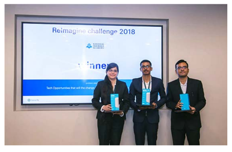
NIA students receiving the award at Swiss Re, Bangalore

Swiss Re Global Business Solutions India Pvt. Ltd. ("Swiss Re") - Competition: